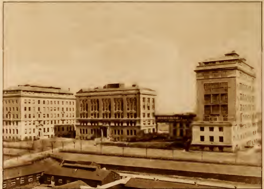
ROCKEFELLER FOUNDATION, Main Building.